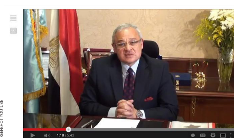
Message from The Minister of Tourism of Egypt (August 22, 2013)

But governments, too, along with local and foreign initiatives are penetrating the social media. The Egypt Tourism Authority website (www.Egypt.travel) promotes Egypt as a travel destination. The messages conveyed show that