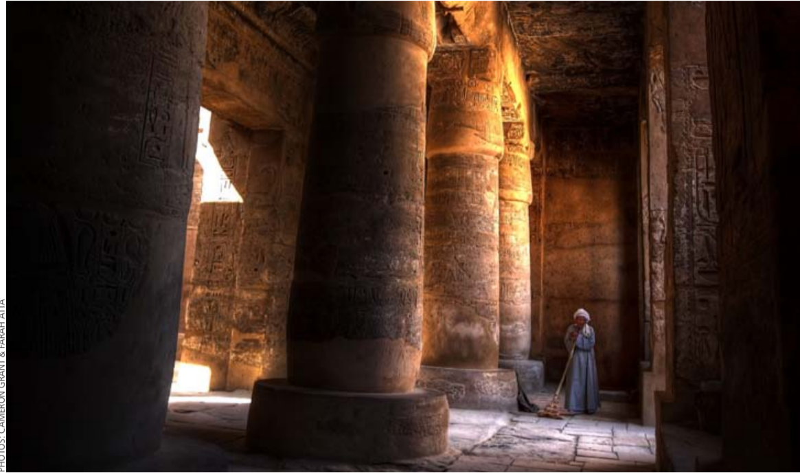
Beautiful since 7000 years: the temples of Luxor, here the Karnak complex

Since my first day here, I felt pity for what the city of monuments is witnessing nowadays; from eco-