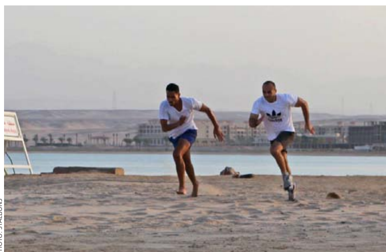
Fitness revives tourism: Egyptians working out in the holiday resort Sahl Hashish at the Red Sea