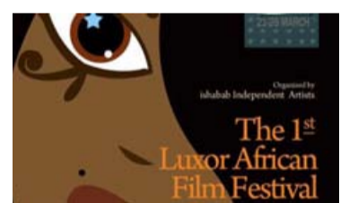
Luxor hosting African films