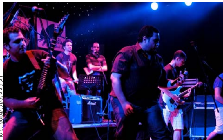
Musicians at the Cairo Jazz Festival: Will it rock tourists numbers?

Cairo International Jazz Festival also hosts a number of side events such as workshops, master classes, film screening, and kids programs. Cairo International Jazz Festival was founded in March 2009. The