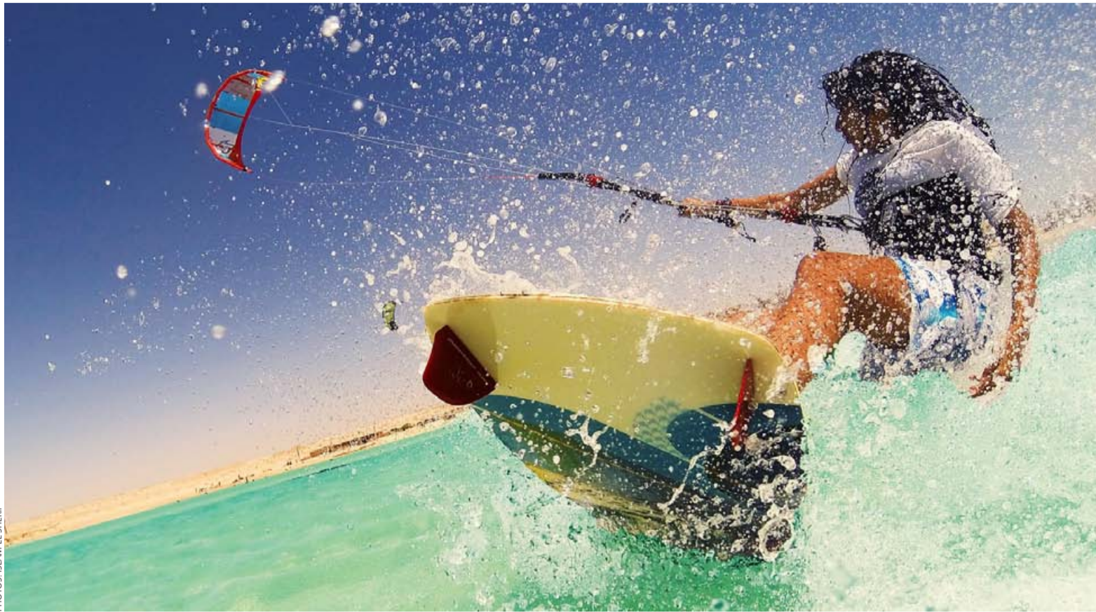
Riding the waves: Surfers enjoying the perfect conditions of the Red Sea Resort Ras Sudr, only 195 kilometre east of Cairo in Sinai

Can sports turn the tourism back to normal?