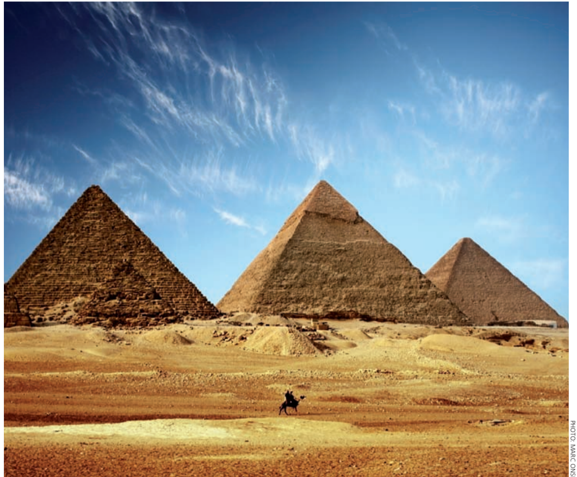
Tranquility at the great pyramids in Giza, for once: Tourists visits have dropped from 50.000 a day to about 15.000 in late 2013 - giving the ancient site some space to breathe and recover its magic charme